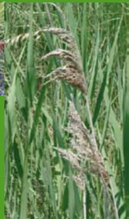
Phragmites australis