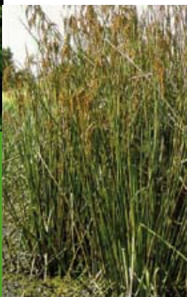
Baumea articulata